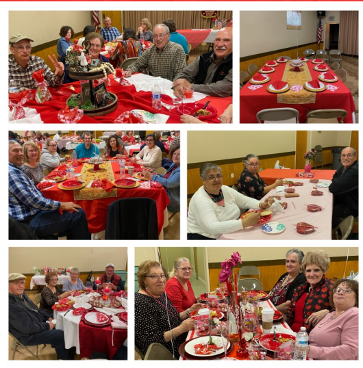
Council 26 - Stevinson/Turlock/Hilmar Valentines Party