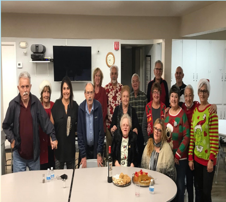
Council 44, San Jose