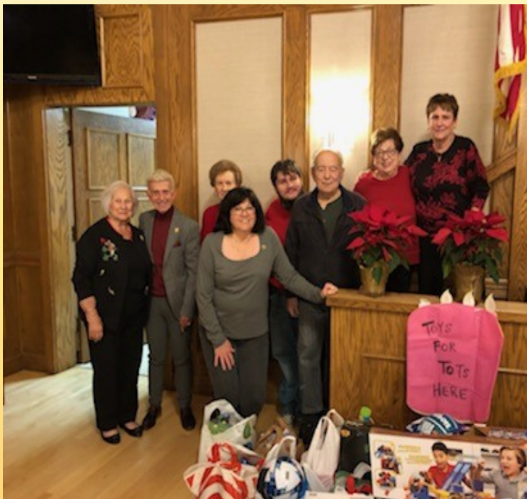
Council 1, San Diego