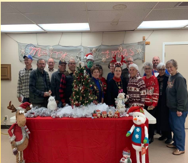
Council 7, Gustine/Newman