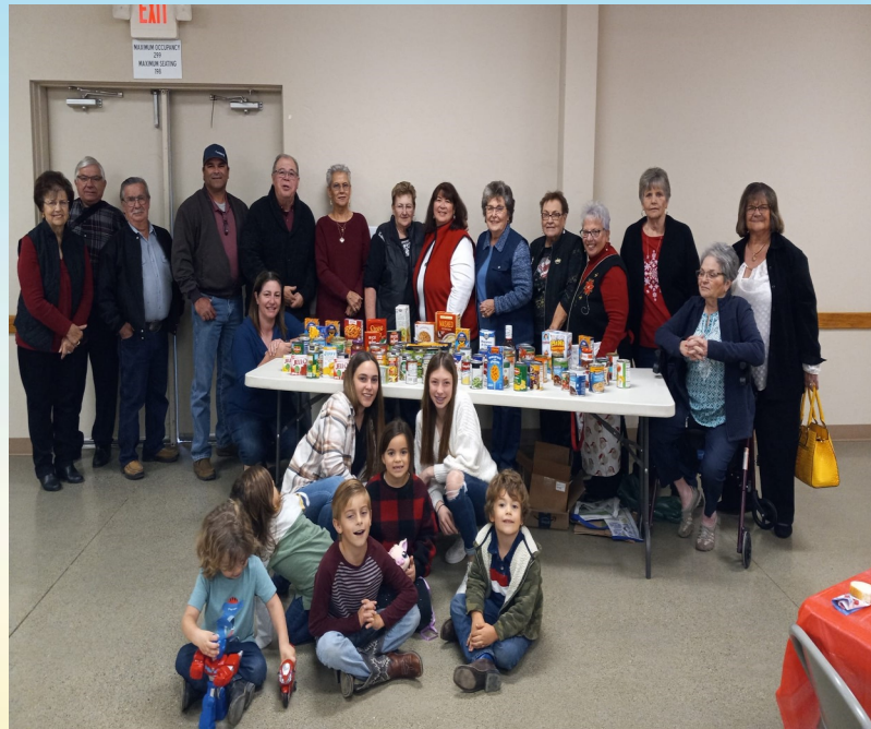
Council 138, Stratford