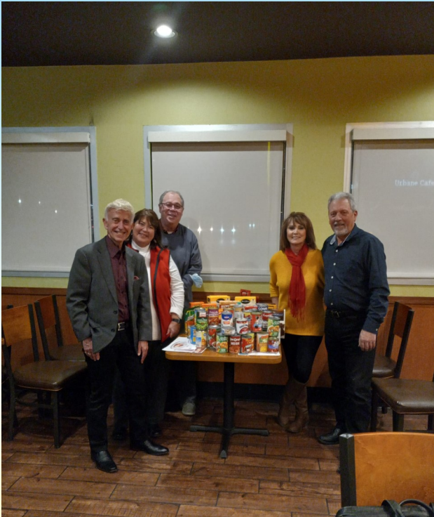
Council 46, Tulare