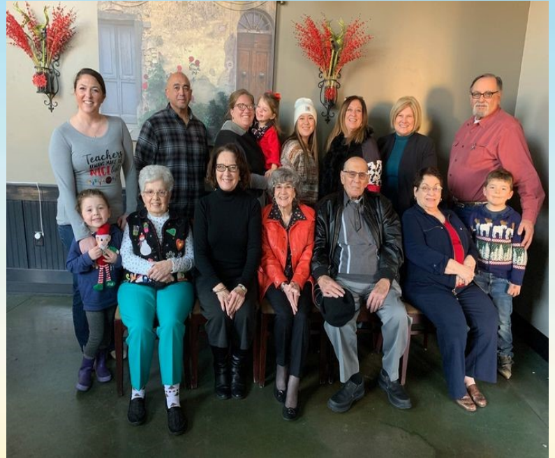
Council 20, Merced