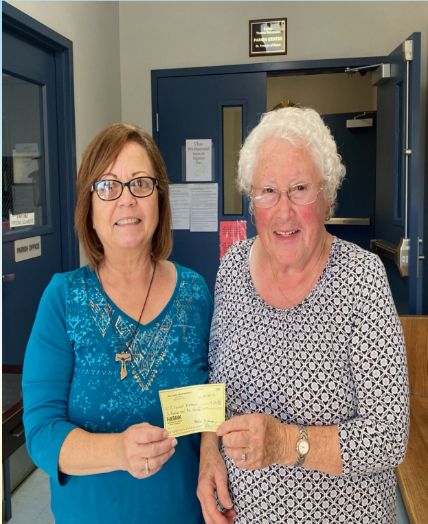
Council 38, Modesto