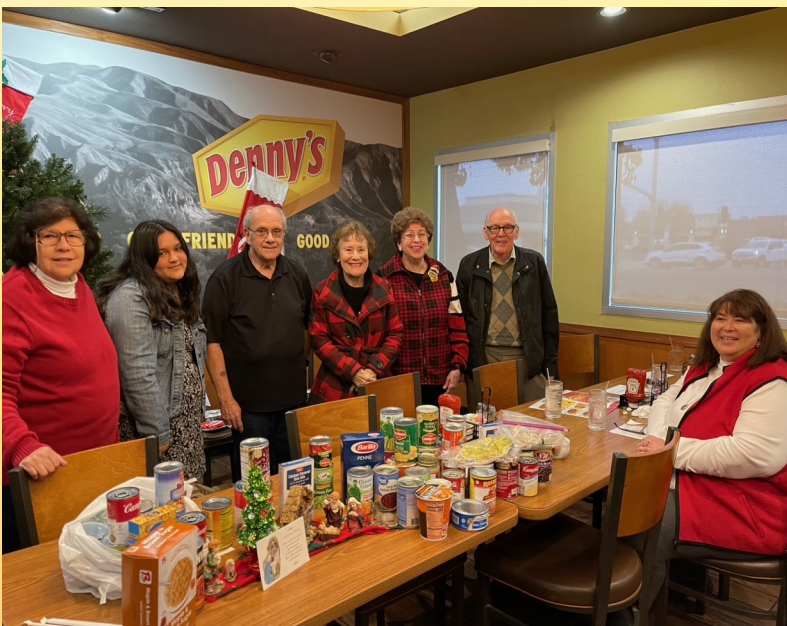
Council 66, Visalia